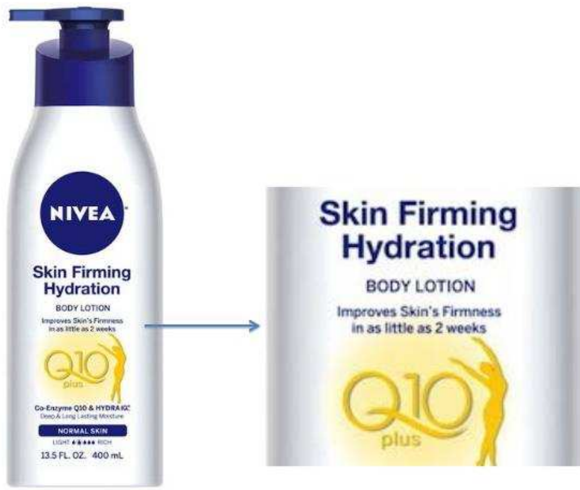
Figure 1 (SAC ¶ 9)

1 2 3 4 5 6 7 8 9 10 11 12 13 14 15 16 17 18 19 20 21 22 23 24 25 26 27 28