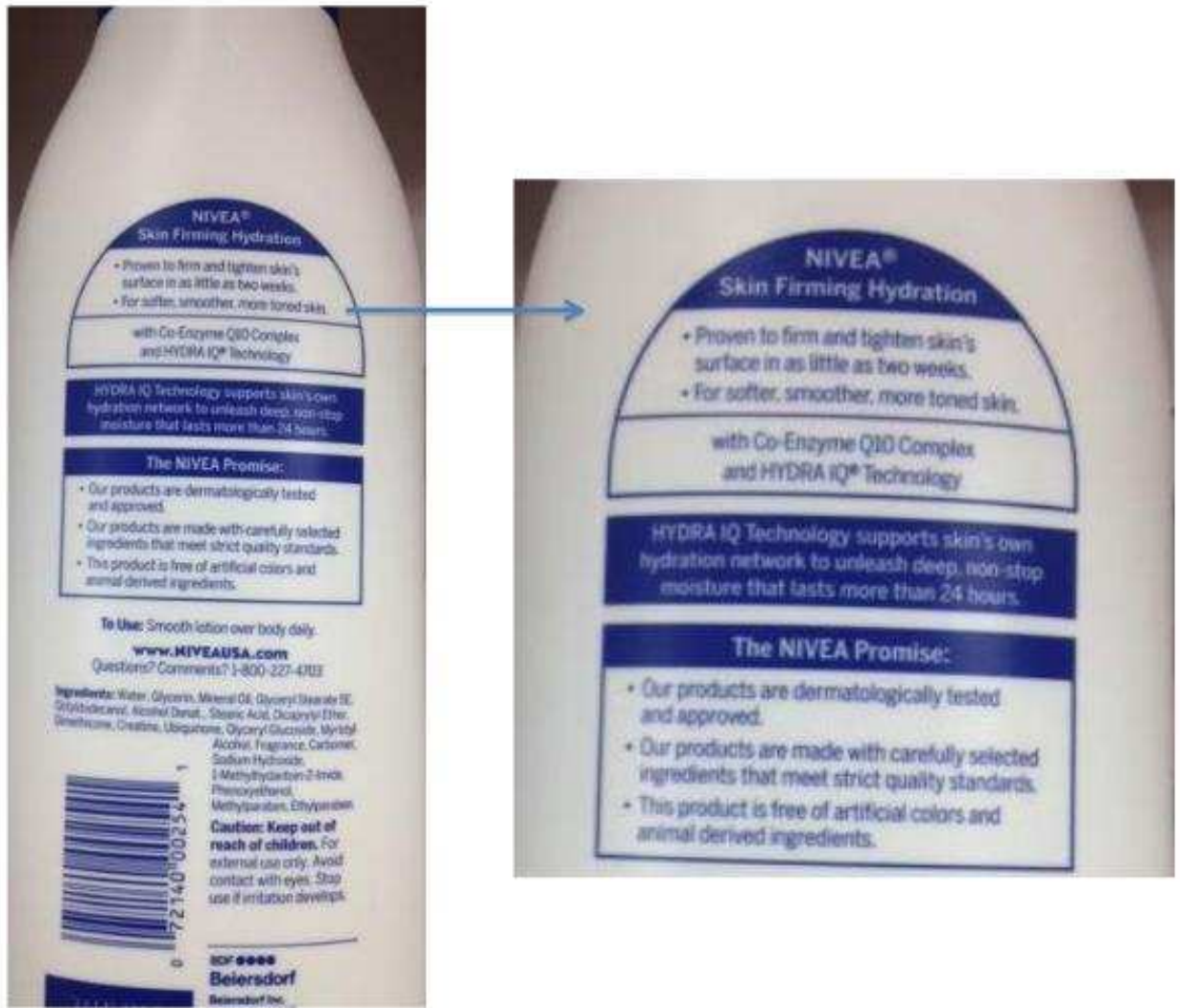
Figure 2 (SAC ¶ 10)

1 2 3 4 5 6 7 8 9 10 11 12 13 14 15 16 17 18 19 20 21 22 23 24 25 26 27 28