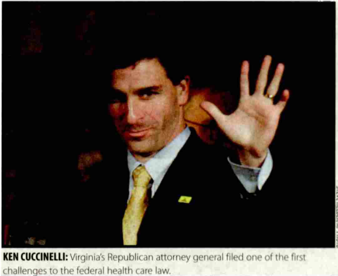
KEN CUCCINELLI: Virginia's Republican attorney general filed one of the first challenges to the federal health care law.